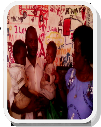
The administrator with a gentle man who is faced with the orphan crisis of twins.

We are thinking of scaling down the services and also some of the staff members who aren't very active with the children so we can reduce on the operational cost at Mama Jane Children Care Centre.