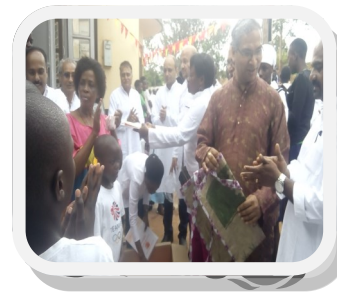
The Indian High Commission in Brown receiving a Kakira Shopping bag as the Administrator looks on