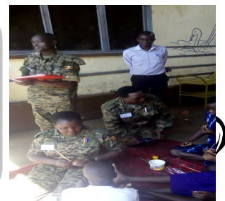
The U.P.D.F officers having a light moment with the children.