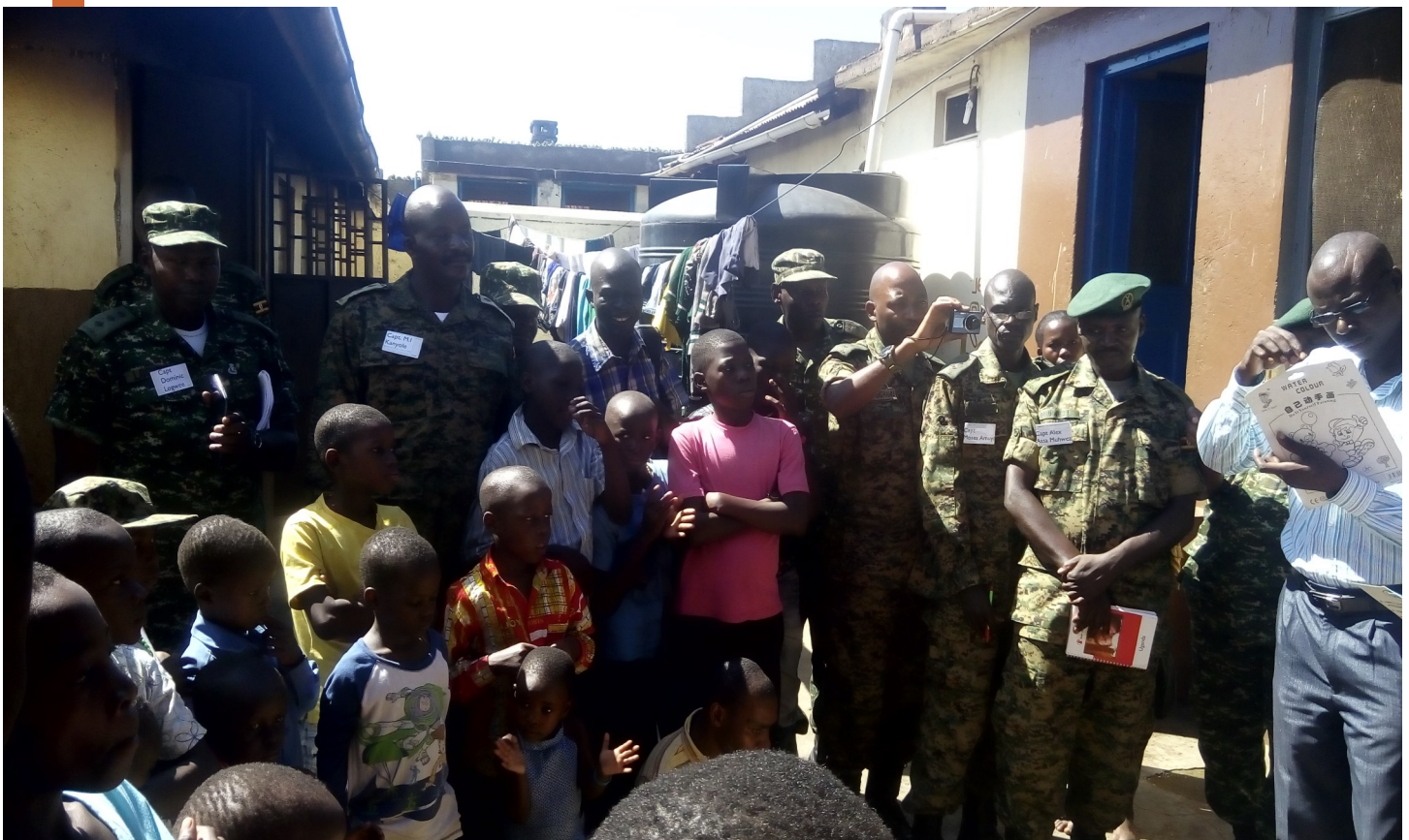
Career Guidance to the children by the People in Uniform together with Save the Children.