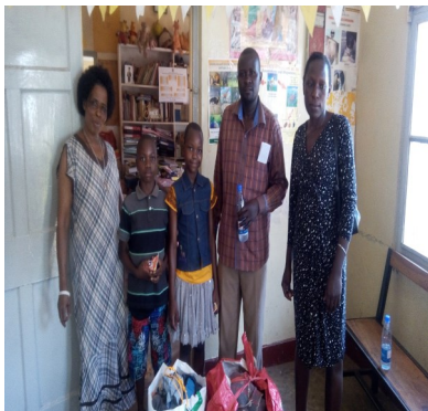
The Administrator together with the children who are being reunited with an uncle. Extreme left is a a colleague from ANPCANN.