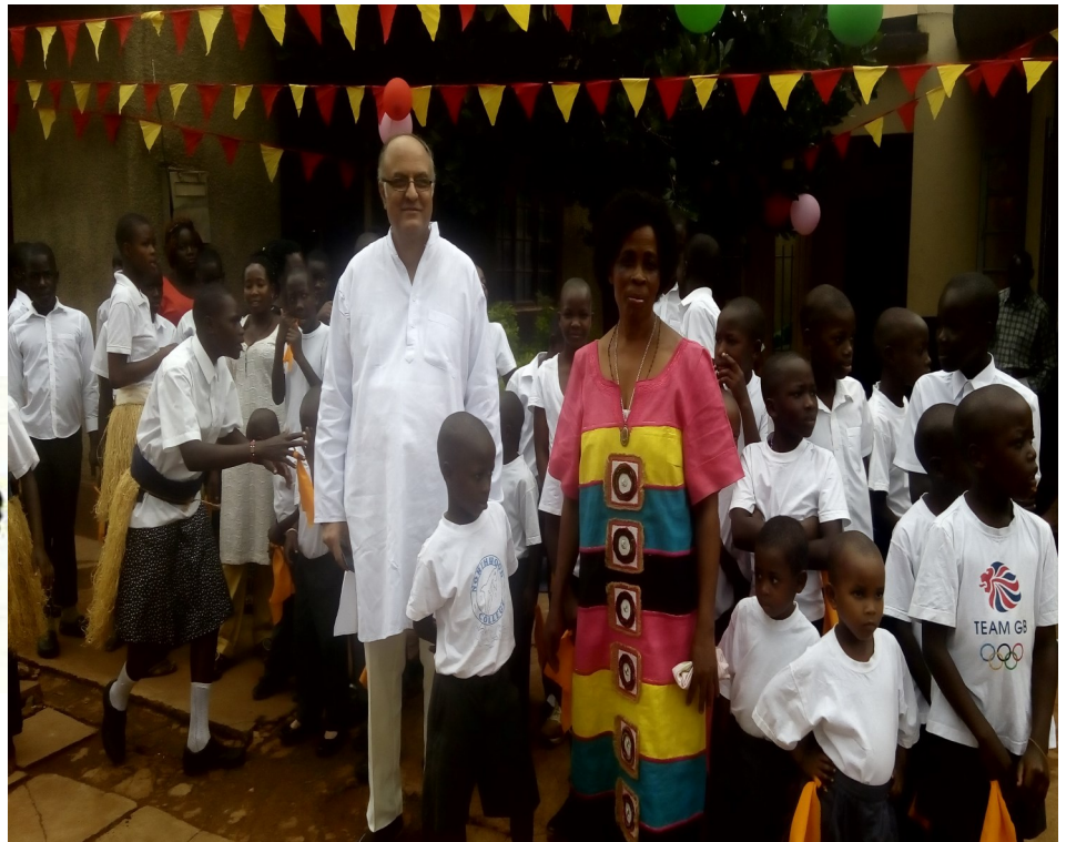
Happy Mahatma Ghandi Day Celebrations at Mama Jane Children Care Centre.